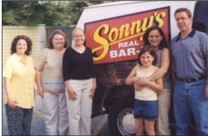
Sonny's Bar-B-Q brings delicious food to "Share-A-Meal" with our families.