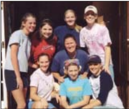
AEPi/L'amifidel from Warner Southern College at Lake Wales came to volunteer at our new House just before the opening.